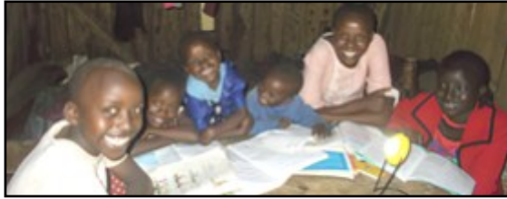
Children of Changing Lens, Changing Lives