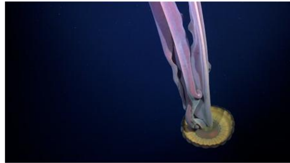
Newly discovered animals and plants 1,500 meters under an Antarctica iceberg.