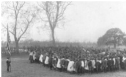
First Memorial Day celebration (May 1, 1865) lead by Black children in Charleston, SC.