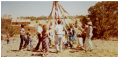
May Day Celebration on United's Property—1981

Kids and adults gather by our birthday months to share lunch (with cupcakes :-)) and get acquainted. All welcome!