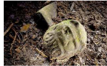
Honduran "Lost City" artifact